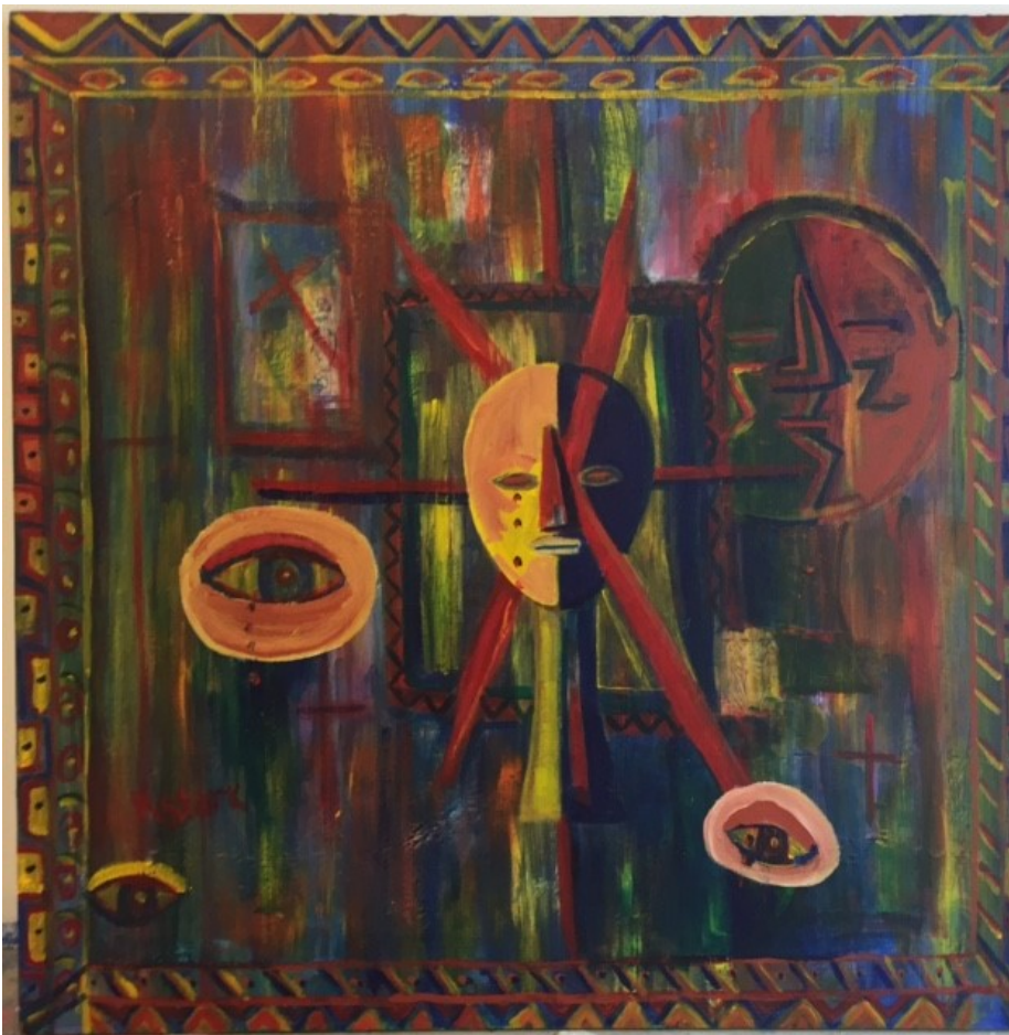
God's Tears for Liberia