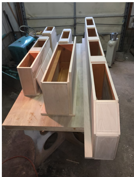
Photos from the cabinet-maker's workshop.